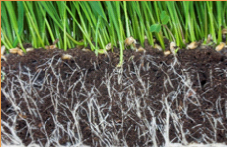
Excellent root development after use of Agrisol soil amendments